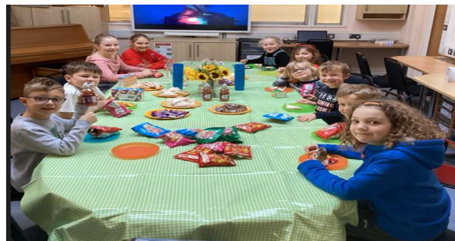
Boom Reader Prize winners enjoying their afternoon tea and Movie